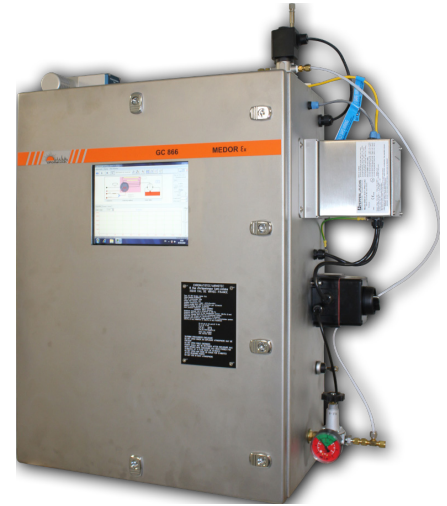
Model: A73022 Exp