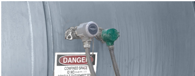
Installation of new DynaCHARGE™ particulate sensor (left) for filter leak detection by row.

Auburn FilterSense’s DynaCHARGE particulate monitors employ charge induction sensing and fully insulated sensing probes to enable reliable operation with conductive particulate, corrosives, and moisture. The plant experienced recurring false alarms from triboelectric sensors and electronic failures from poor quality. These issues took valuable time away from core operations.