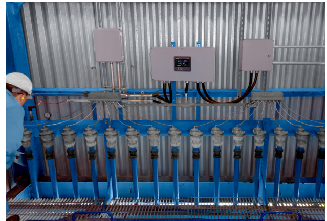
Auburn FilterSense engineer inspecting B-PAC function (center) and pulse valves (below).

B-PAC controls provide real-time diagnostics to detect/locate failed solenoids and pulse valves. At start-up the B-PAC on the dross process quickly identified failed solenoids in rows 4, 47, and 49, avoiding catastrophic filter failure, emissions, and unexpected shutdown. Intelligent DP control keeps the baghouse optimized.