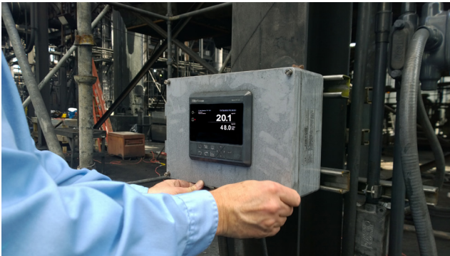
Auburn FilterSense engineer commissioning DynaCHARGE™ PM 100 PRO.

Unlike Auburn FilterSense, other sensors required monthly to quarterly cleaning, sometimes weekly!