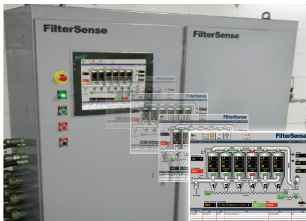
Engineered B-PAC System monitors and controls a network of multi-compartment Coke, Desulf and Casting Baghouses at a steel mill (shown left). Screenshot (lower right): shows particulate levels and damper control.

With the ability to locate leaks by filter row, monitor solenoid and pulse valve health, minimize pulsing, and maintain baghouse DP within 0.1 InWC, operators at steel mills minimize downtime and maintenance costs, while reducing and often eliminating exposure of plant personnel to hazardous particulate and confined spaces.