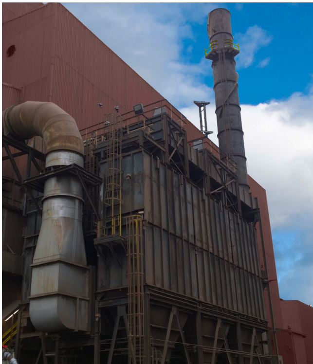
“Desulf” baghouse at a US steel mill. Leak analysis, pulse cleaning, DP, solenoids, valves, airflow, and temperature are monitored by an engineered B-PAC™ System (shown right).

“B-PAC™ guarantees proper airflow, increasing the efficiency of the upstream coke oven.”