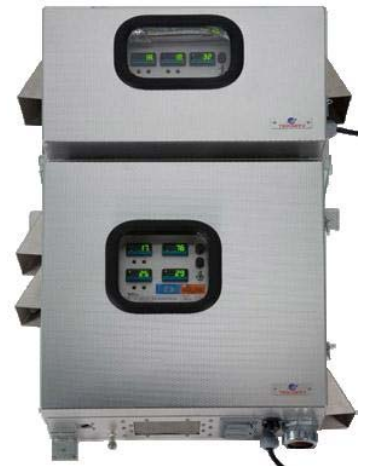
Shown installed with Model 1130

One of the greatest problems with conventional particulate mercury measurement methods is that reactive gaseous mercury will be trapped on the filter medium along with the particulate bound mercury. This can result in large measurement artefacts. The Tekran speciation system solves this problem by removing the reactive gaseous component using a denuder before sampling the particulate mercury.