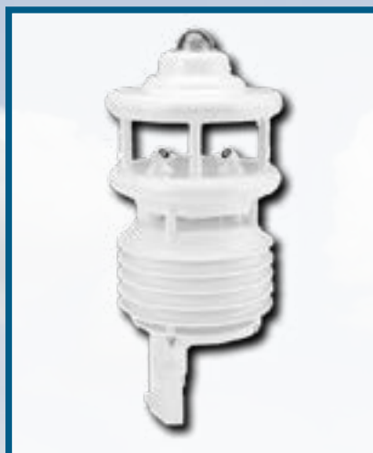
Lufft WS501: Wind Speed & Direction, Air Temp, Air Pressure and Solar Radiation