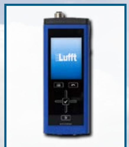
Lufft XP101: Handheld Air Temperature and Pressure meter