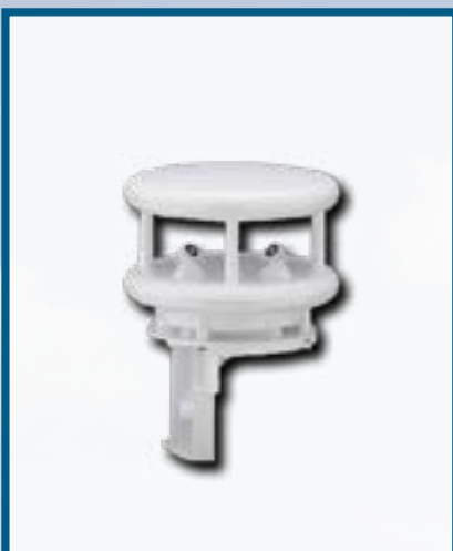
Lufft WS200 Ultrasonic Wind Speed and Wind Direction

Lufft's wide range of weather sensors cover all of the following parameters; Temperature, Humidity, Pressure, Precipitation, Solar Radiation, Lightning Detection, Wind Speed and Direction